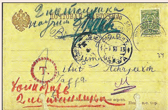
Figure 7 The only Russian taxed item with clear evidence – by manuscript – of charges having been collected.

Another 3 Kop postcard is shown in Figure 6. It was mailed on June 29, 1905 from Ekaterinoslav to Jerusalem by the Zionist leader M. Usishkin, just before he left for the 7th Zionist Congress in Basel, Switzerland. This postcard is also underpaid 1 Kop, therefore an encircled “T” was applied, probably by the office of origin. Further markings are an Odessa transit mark on July 1, and “ROPIT JERUSALEM” arrival dated July 19, 1905.