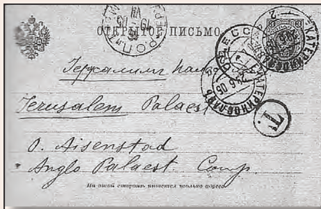
Figure 6 Russian 1905 3 Kop postcard to Jerusalem showing circled “T” and “ROPIT JERUSALEM” arrival postmark.

is faintly seen on the lower right corner.